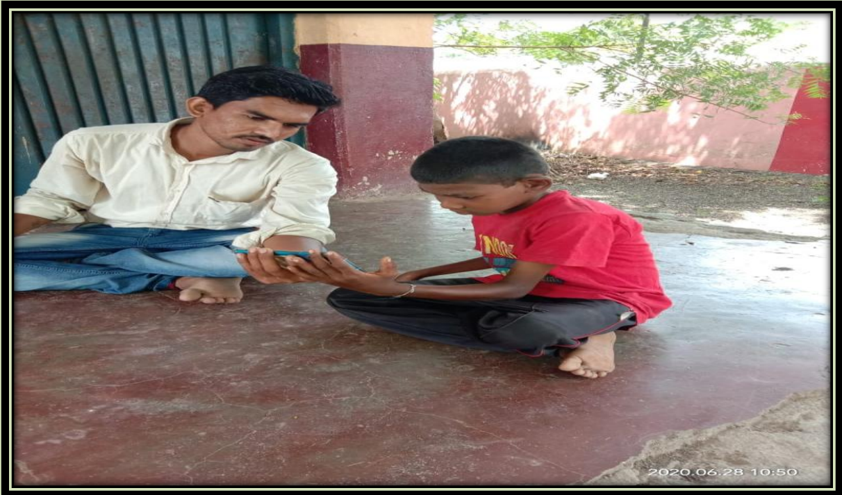
Distribution of Food Kit to Homebased